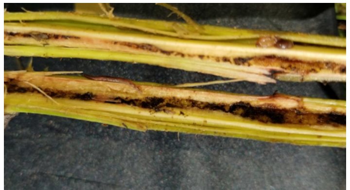
Larvae and stem damage

A County of Wetaskiwin resident has been using stem-gall fly to control thistle in large patches along a wetland riparian area comprised of native willow, aspen and balsam poplar. Flies have been released in several spots and thistle number has reduced in some patches. The resident said, "I would usually spray out thistle but won't do that in this sensitive area. Watching for stem-gall fly activity and over-wintering galls is a lot more fun than hand-pulling thistles."